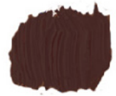
TRANSPARENT OXIDE ORANGE (T)