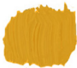
CAD YELLOW MED