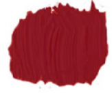
TRANSPARENT RED MED (T)