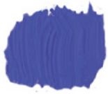
VIOLET OR PURPLE DIOXAZINE (T)