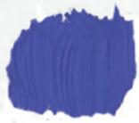
DIOXAZINE PURPLE (T)