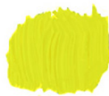
LEMON YELLOW HUE