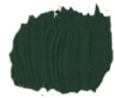
SAP GREEN (T)