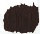
TRANSPARENT BROWN OXIDE (T)