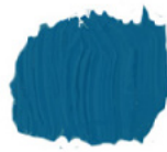
PHTHALO TURQUOISE (T)