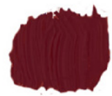
PERM ROSE (T)