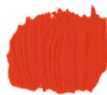
CAD ORANGE HUE