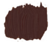
BURNT SIENNA (T)