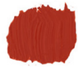
INDIAN YELLOW (T)