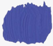
Violet or Purple Dioxazine (T)