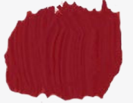
TransparentRed Med (T)