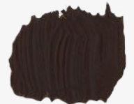
Oxide Brown (T)