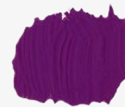
Quinacridone Violet (T)