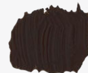
Imidazolone Brown (T)