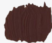
Oxide Red (T)