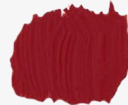
TransparentRed Med (T)