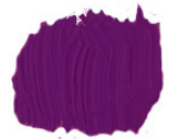
QUINACRIDONE VIOLET (T)