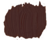
TRANSPARENT OXIDE RED (T)