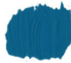
PHTHALO TURQUOISE (T)