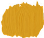
CAD YELLOW HUE