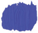
DIOXAZINE PURPLE (T)