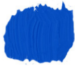
FRENCH ULTRA MARINE BLUE (T)