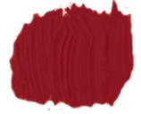
TRANSPARENT RED MED (T)