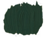
SAP GREEN (T)